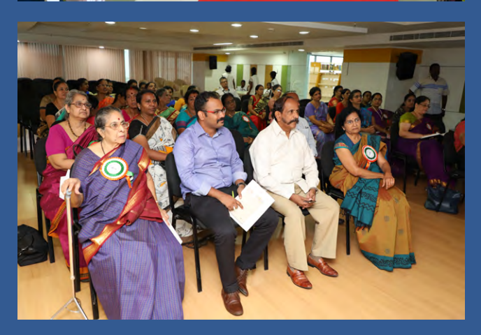
Training workshops in India