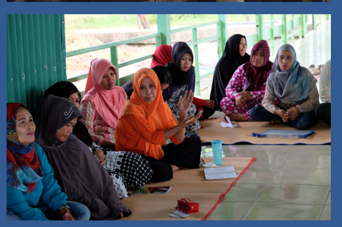
Local and national consultations in Indonesia