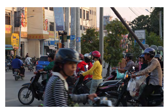
Urban transport is both a climate and a gender issue