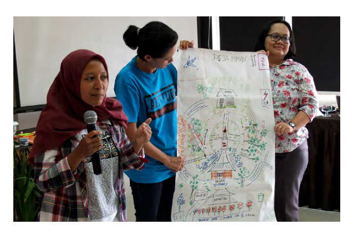
Working with GAMMA @ GenderCC